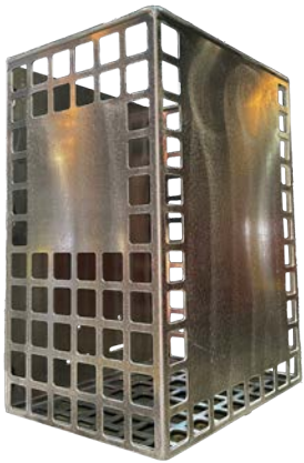
Custom Container HLP-007