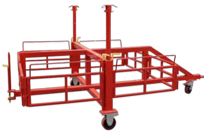
Large Mobile Trolley HLP-015