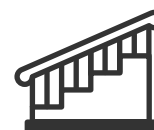
Handrails & Fencing