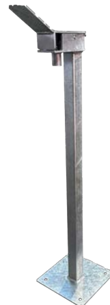
Bin Stand HLP-003