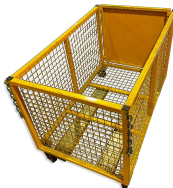
Cage Trolley HLP-016