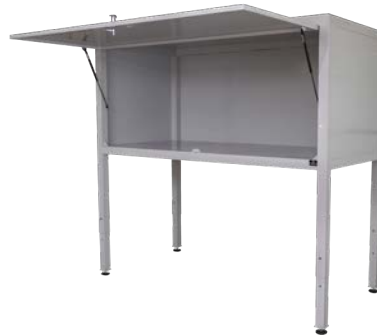
GarageSafe Over-Bonnet HLP-008